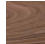
NC | NOCE CANALETTO

FINITURA INSERTI INSERTS FINISH FINITION des INSERTS