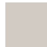
L0 | LACCATO OPACO

FINITURA DELLA STRUTTURA STRUCTURE FINISH FINITION DE LA STRUCTURE