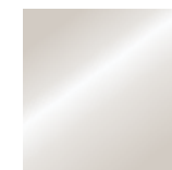
L2 | LACCATO LUCIDO